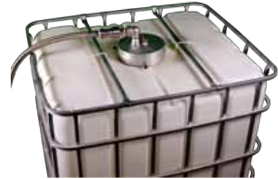
Optional 6" Screw-Lid Adapter