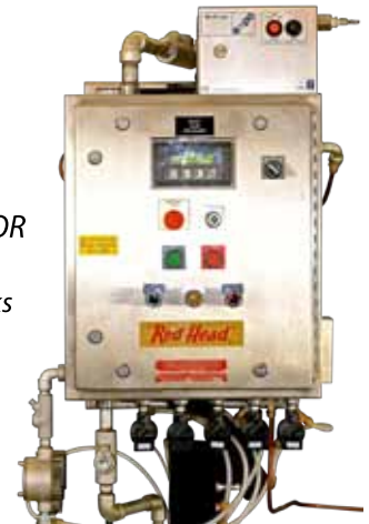
ALLEN-BRADLEY MICROPROCESSOR CONTROLLER All operating controls, safety interlocks on one screen.